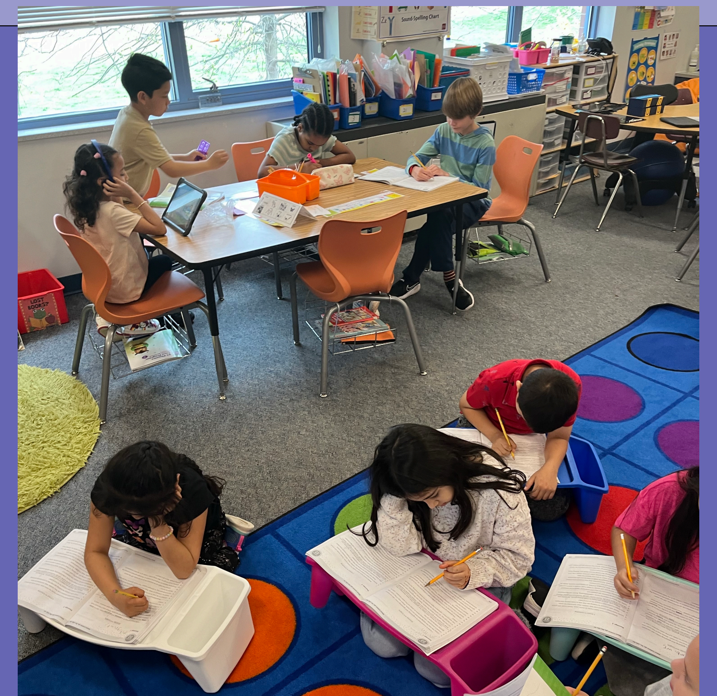
Students Enhancing Reading Comprehension and Pronunciation Skills