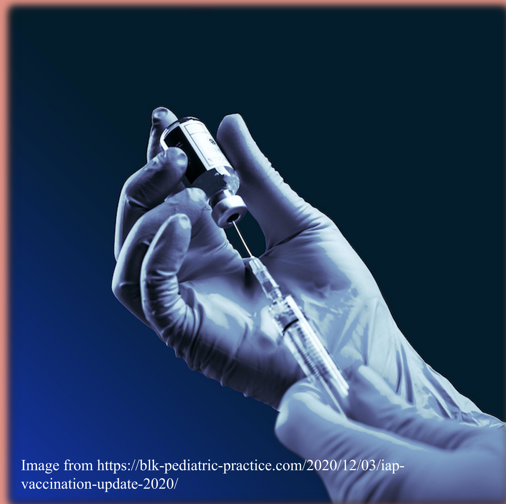
Image from https://blk-pediatric-practice.com/2020/12/03/iap-vaccination-update-2020/